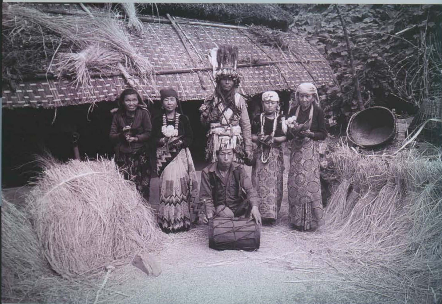
A Dumi shaman with an entourage of officiants in eastern Nepal