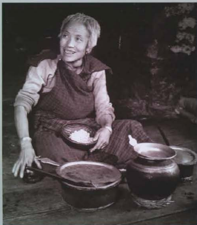
A 'Ngalop woman cooking at Neptengkha, a native speaker of Dzongkha in western Bhutan officiants in eastern Nepal

The nooks and crannies of the Himalayas are full of beautiful landscapes and lovely people, but they are also full of real surprises. Until the 1990s, both Gongduk and the Black Mountain language in central Bhutan remained totally unknown to science and to the outside world. Needless to say, the people in these language communities themselves, and their immediate neighbours, knew about their own existence. Yet even these people had no idea of how special their languages are in the context of Himalayan and Asian prehistory. Other truly special languages, such as the Lhokpu language of southwestern Bhutan, remained totally uninvestigated until they were first studied and documented by our research programme.